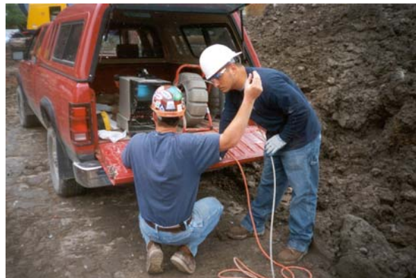
Observing the bottom in real time, and video-taping the event with the built-in VCR