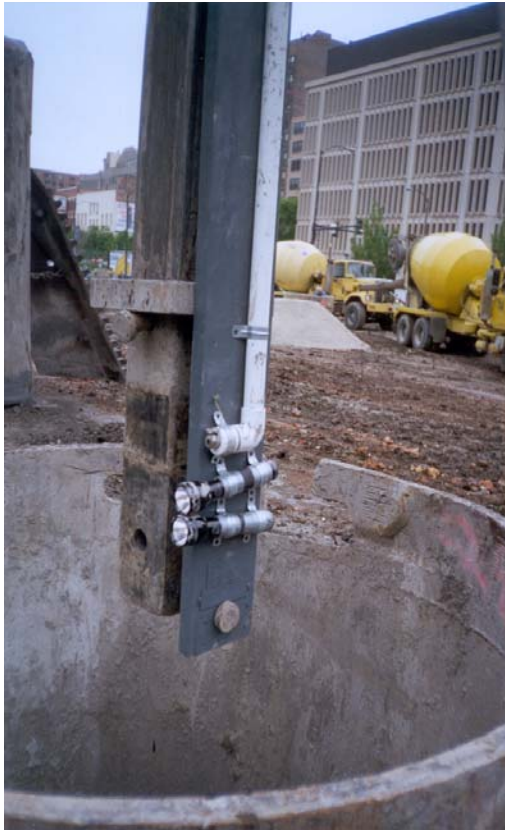
“SeeSnake” fiberoptic viewer attached to Kelly bar, with lighting

GME was founded in 1981 to provide engineering, consulting, and testing services to architects, engineers, developers, government agencies, owners, and contractors. No longer can caisson inspectors “Ride the Ball” to the bottom of the caisson. With the “SeeSnake,” we can observe the bottom and videotape the entire process.