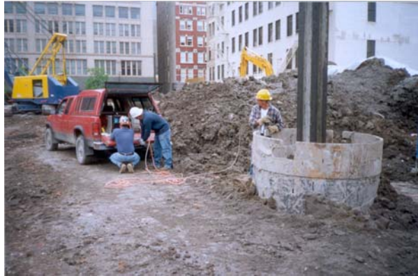
The observation is conveniently and quickly carried out